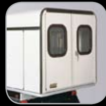
Custom Van Box