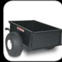
Swisher Dump Cart