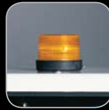
Safety Strobe Light