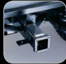
2-Inch Rear Receiver Hitch