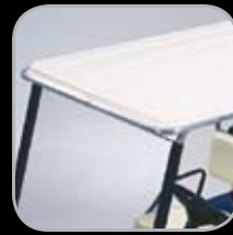
Canopy Top White