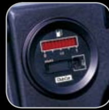
Fuel Gauge and Hour Meter