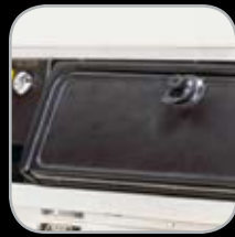
Locking Glove Box