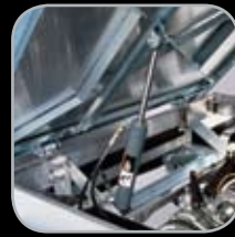
Hydraulic and Electric Bed Lift