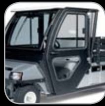
Certified ROPS Cab Enclosure