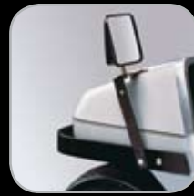
Heavy-Duty Bumper/ West Coast Mirror